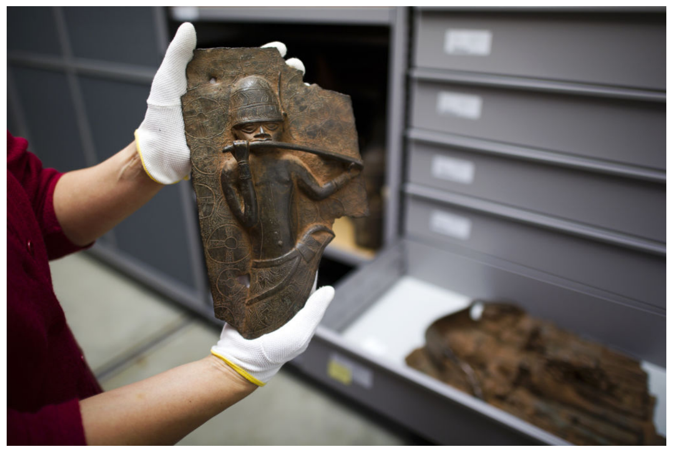
A small brass relief plate from the Benin Empire depicting royal hornblowers from a drawer of a rolling shelf in the depot of the Dresden State Art Collections in Dresden.