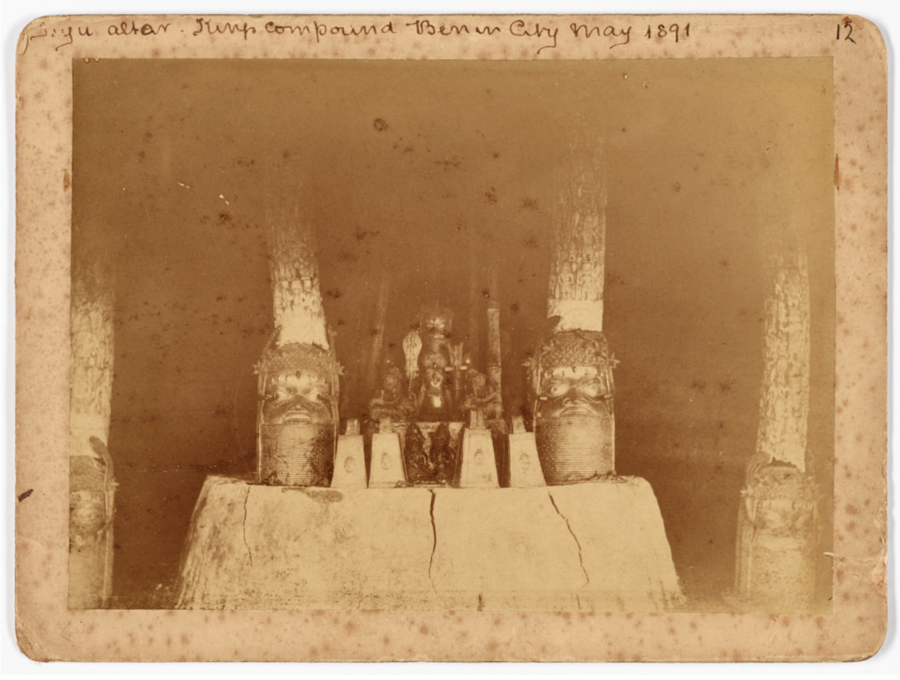
Photograph of an ancestral shrine at the Royal Palace, Benin City taken during the visit of Cyril Punch in 1891.

Artnet News reached out to 30 museums known to hold Benin bronzes to ask for an update on their position on restitution, and the status of objects in their collection.