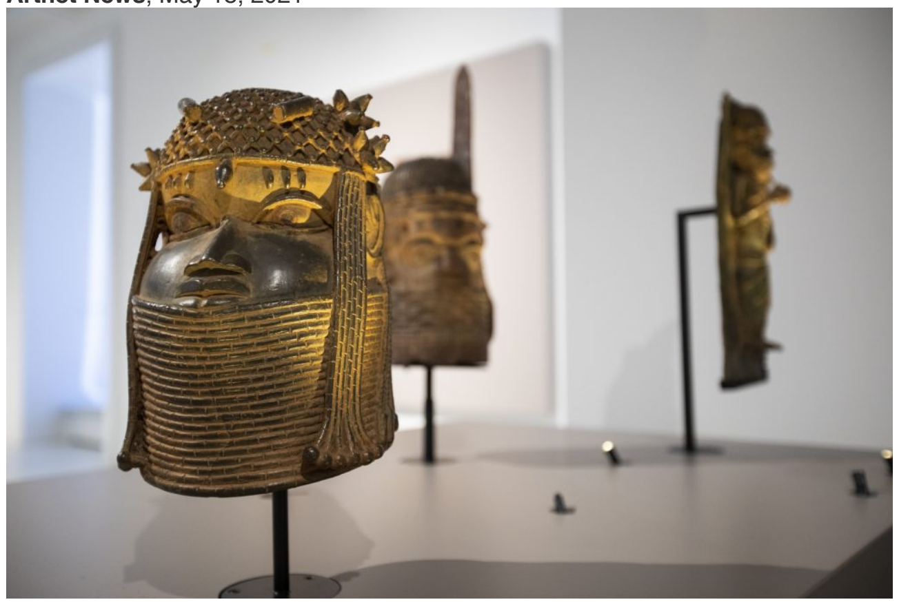
Benin bronzes "MEMORY, Momente des Erinnerns und Vergessens," Museum der Kulturen, Basel.

Germany's <u>landmark announcement</u> that it would begin to restitute Benin bronzes as soon as 2022 sent ripples through museum communities around the world. The contentious objects, known to have been looted from the Benin Royal Palace in 1897, are scattered across some of the most prominent museums the world over. From institutions like the Metropolitan Museum in New York, which holds 163 pieces, to the University of Pennsylvania's Museum of Archaeology and Anthropology, which holds 100