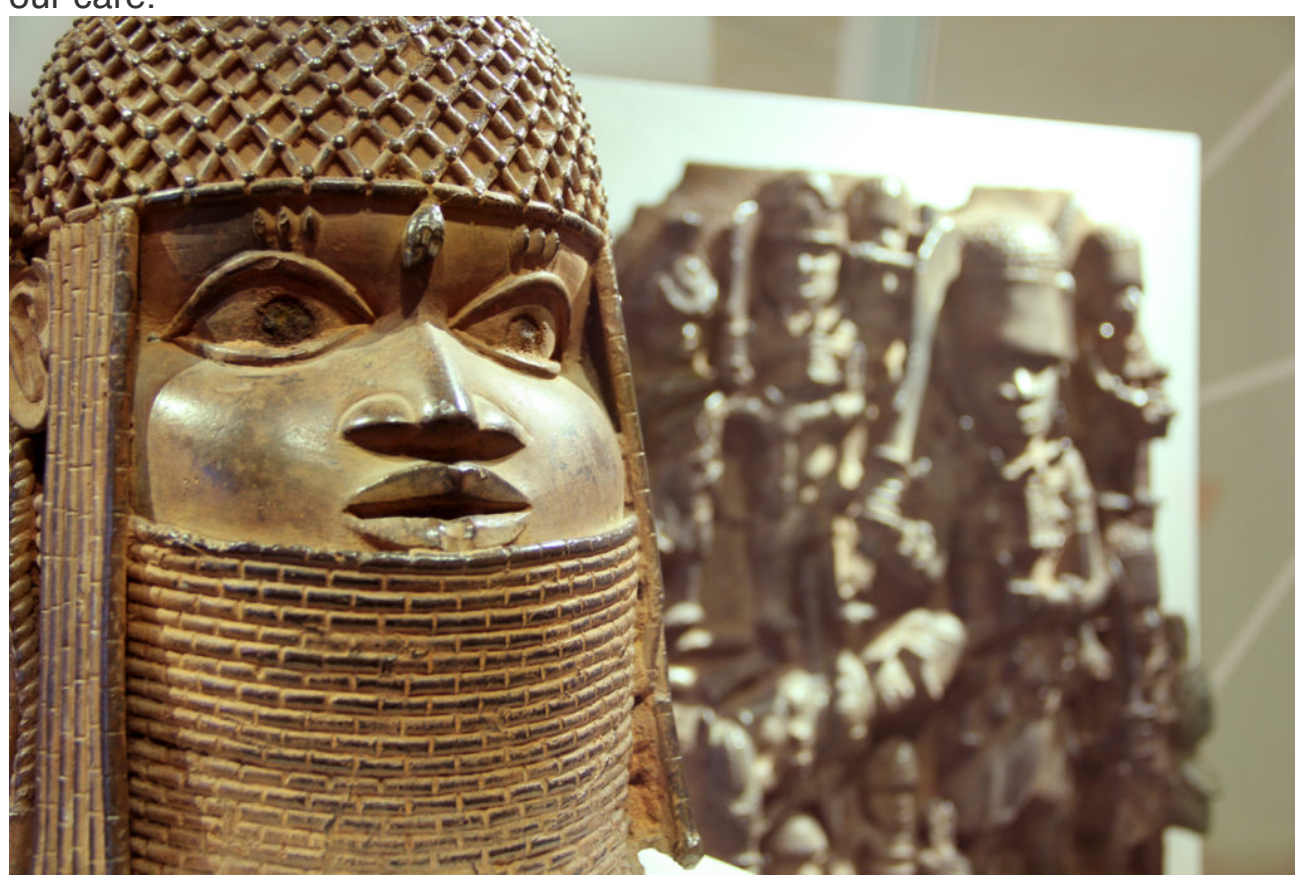
Exhibition view of "Looted Art? The Benin Bronzes" at MKG in Hamburg.

Initiatives: We are a member of the Benin Dialogue Group and are committed to working with other museums across Europe and representatives of the Edo State Government, the Royal Court of Benin, and the National Commission for Museums and Monuments, Nigeria, sharing information and knowledge and working towards a major reunion of the Benin works of art in Benin City. We are also working with the Digital Benin project to understand and share more about the provenance of the Benin objects in our care.